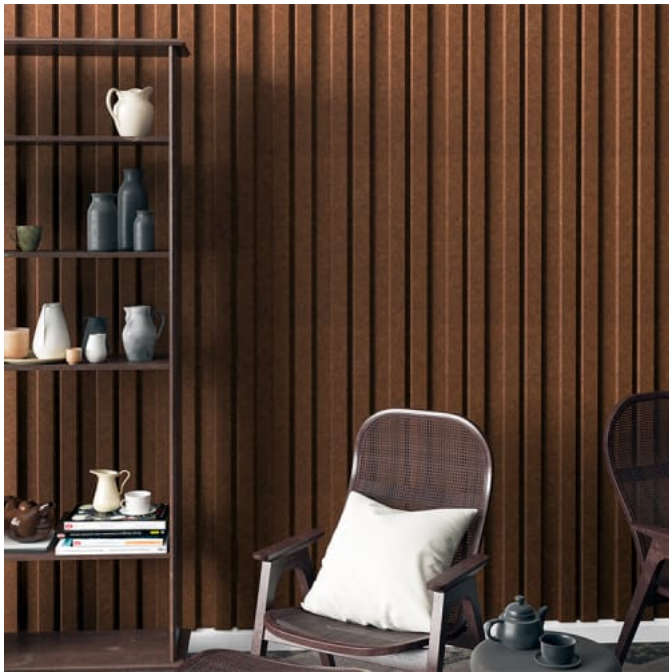
3D Panel Batten 2 Bark