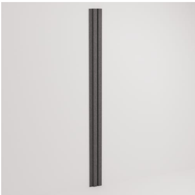
3D Panel Batten 2 Detail