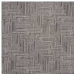
959 IRON ONE