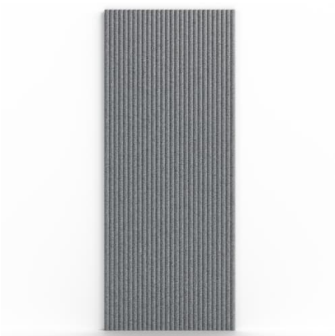
Emboss Panel Corduroy Detail