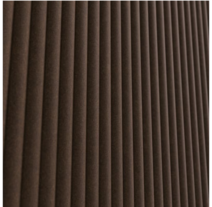
Emboss Panel Corduroy Detail Bark