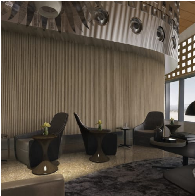
Emboss Panel Corduroy Spotted Gum