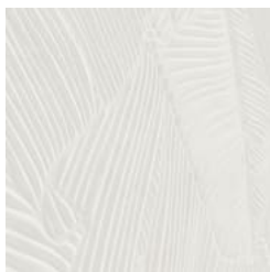
Emboss Panel Jungle Detail Ivory