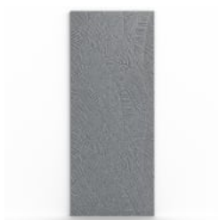
Emboss Panel Jungle Detail