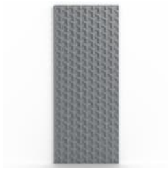
Emboss Panel Linked Detail