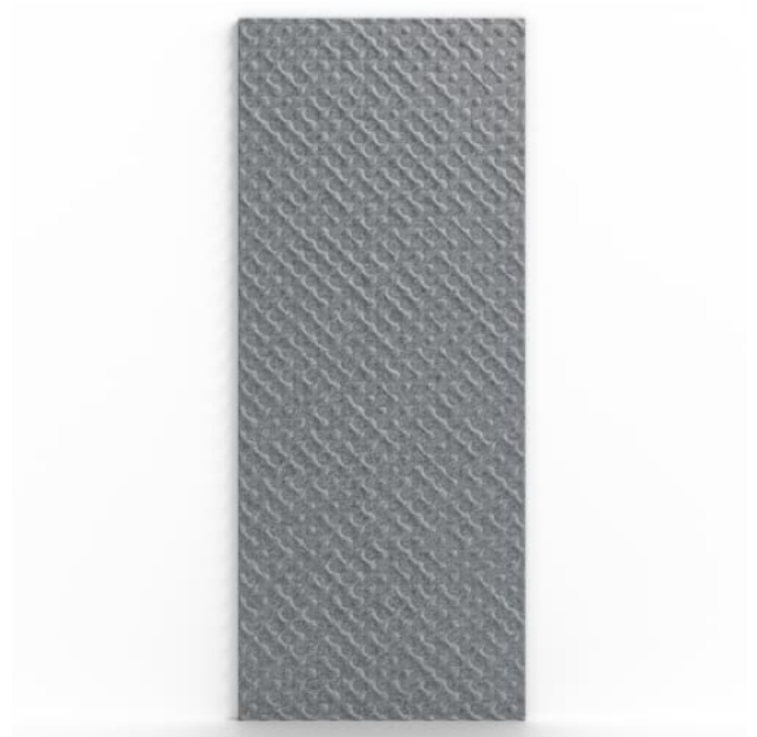
Emboss Panel Molecular Detail