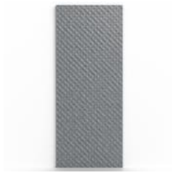
Emboss Panel Molecular Detail