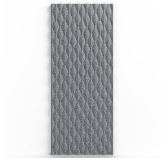
Emboss Panel Sandglass Detail