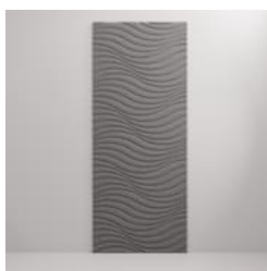
Emboss Panel Tidal Detail