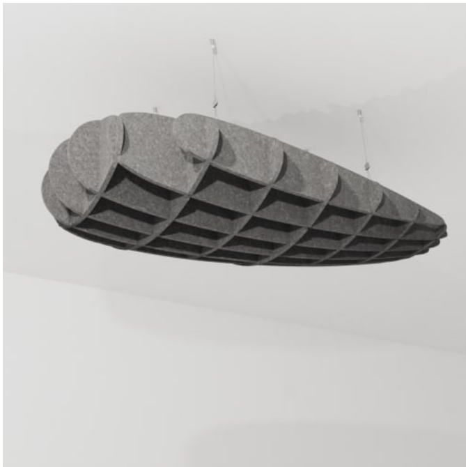
Clouds Stratus Detail