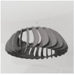
Clouds Turbine Detail