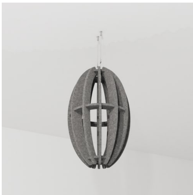
Clouds Giffard Detail