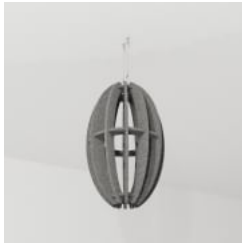
Clouds Giffard Detail