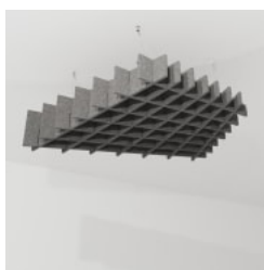
Clouds Clochette Detail