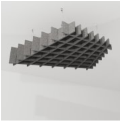
Clouds Clochette Detail