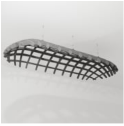
Clouds Long Dome Concave Detail