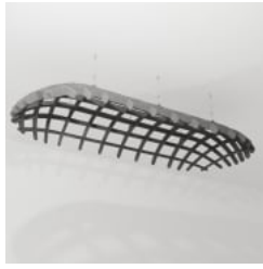
Clouds Long Dome Concave Detail