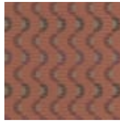
441 CORAL REEF