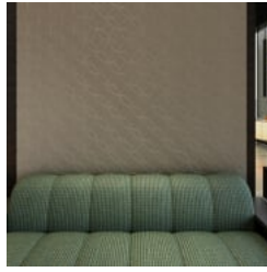
Etch Panel Kaleido Chambray