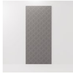
Etch Panel Kaleido Detail