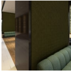
Etch Panel Kaleido Olive