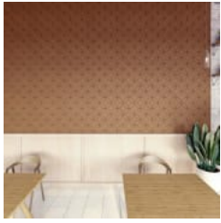
Etch Panel Kaleido