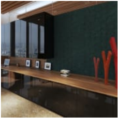
Texture Cercles Malachite