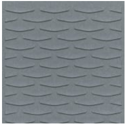
Texture Echelle Detail