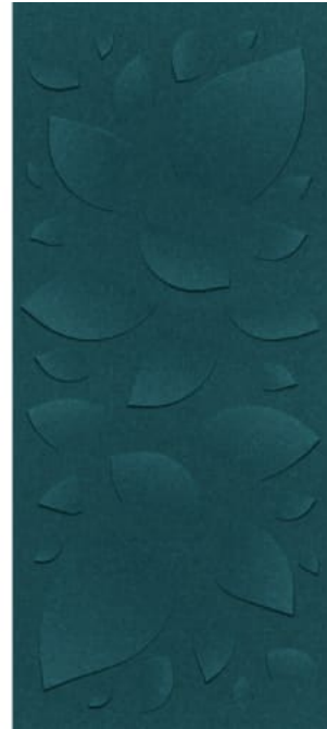
Texture Nenuphar Panel