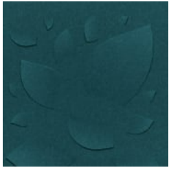
Texture Nenuphar Detail