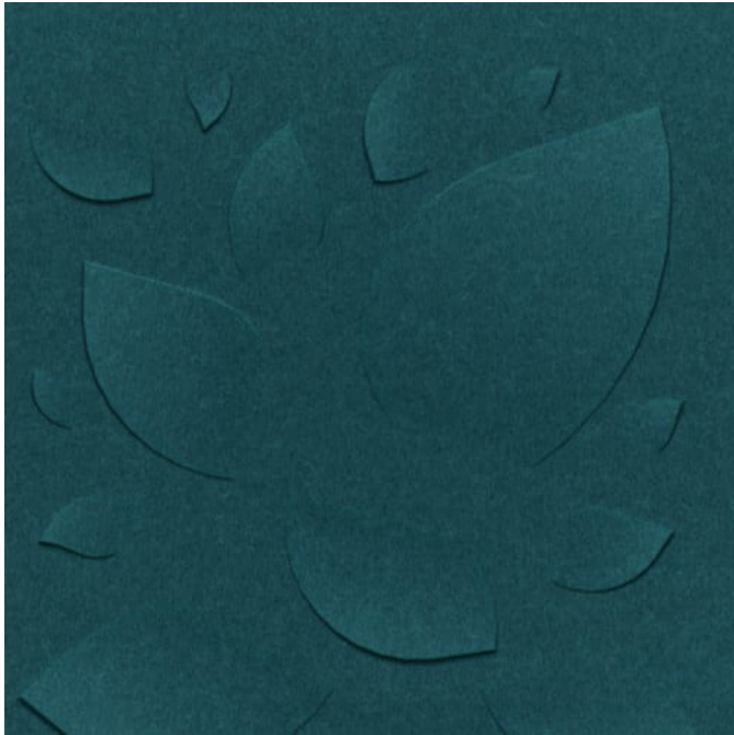
Texture Nenuphar Detail