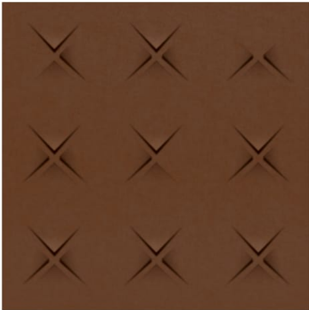
Texture Signe Detail