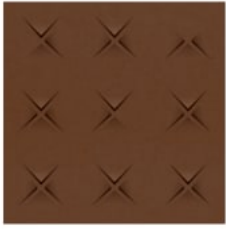
Texture Signe Detail