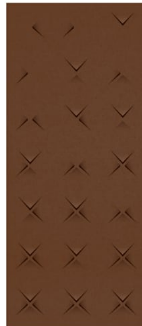
Texture Signe Panel