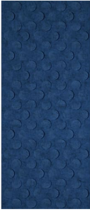
Texture Panel Trappe Detail