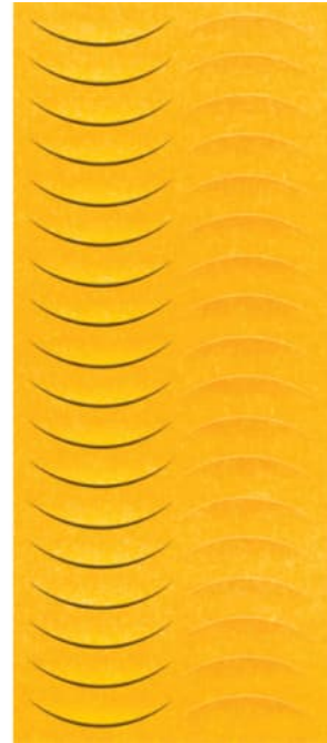
Texture Panel Vague Detail Full Panel