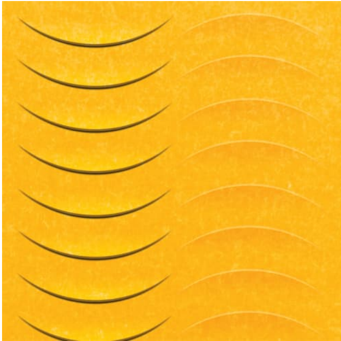
Texture Panel Vague Detail