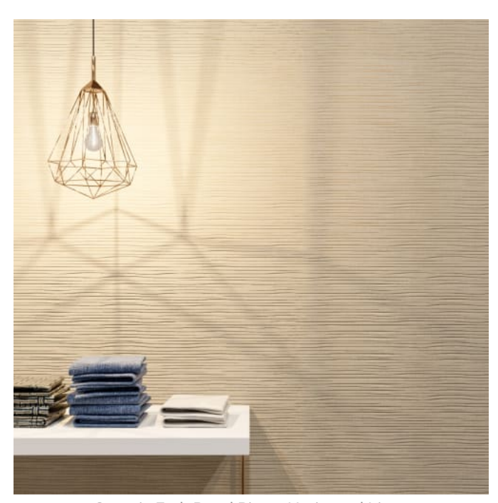
Organic Etch Panel Rivers Horizontal Linen