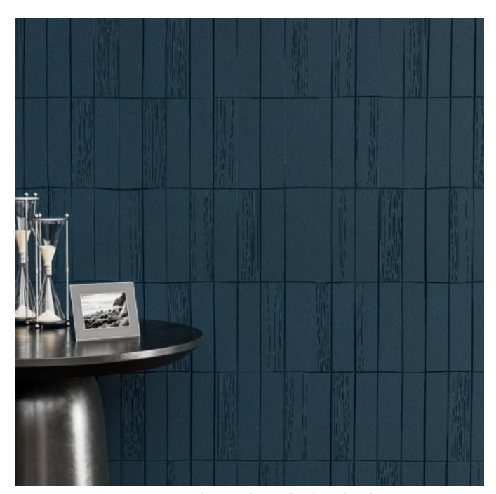
Organic Etch Panel Stacked Midnight