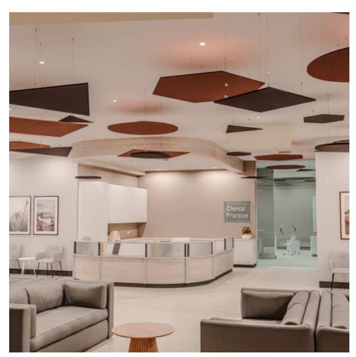
Shapes Square, Hexagon & Circle