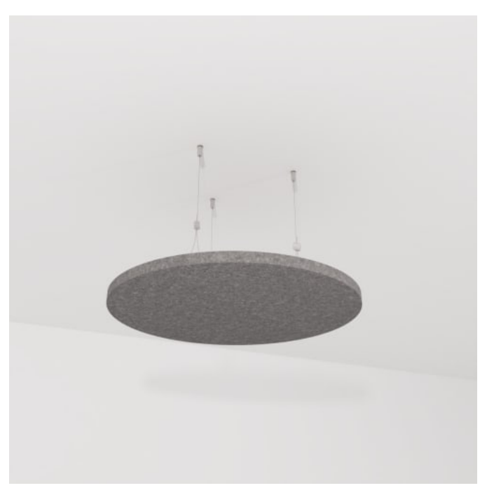
Shapes Circle Detail