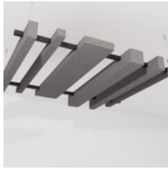
Box Baffles Random Detail