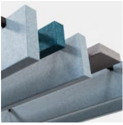
Box Baffles Random Detail