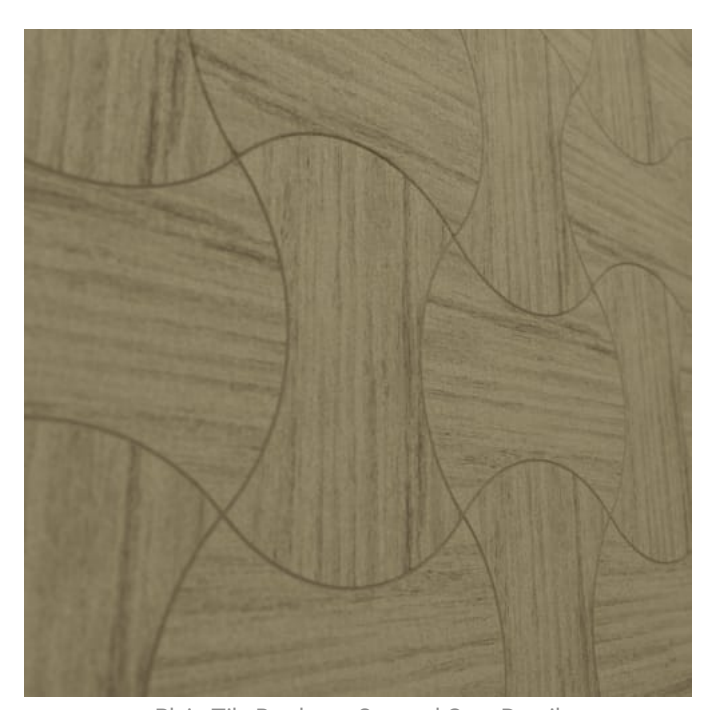
Plain Tile Battleaxe Spotted Gum Detail