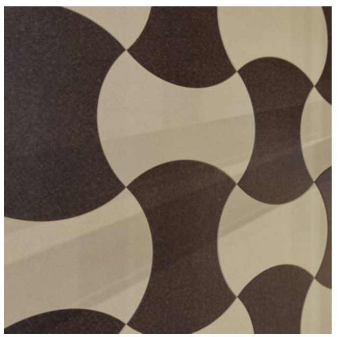
Plain Tile Battleaxe Slate Linen and Ecru Close Up