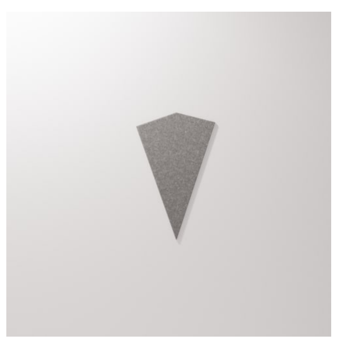
Plain Tiles Diamond Detail