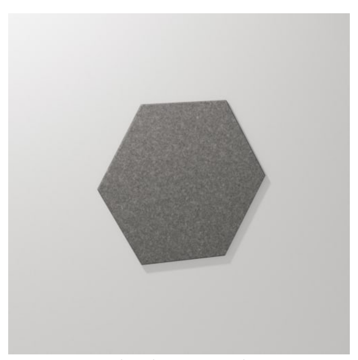
Plain Tile Hexagon Detail