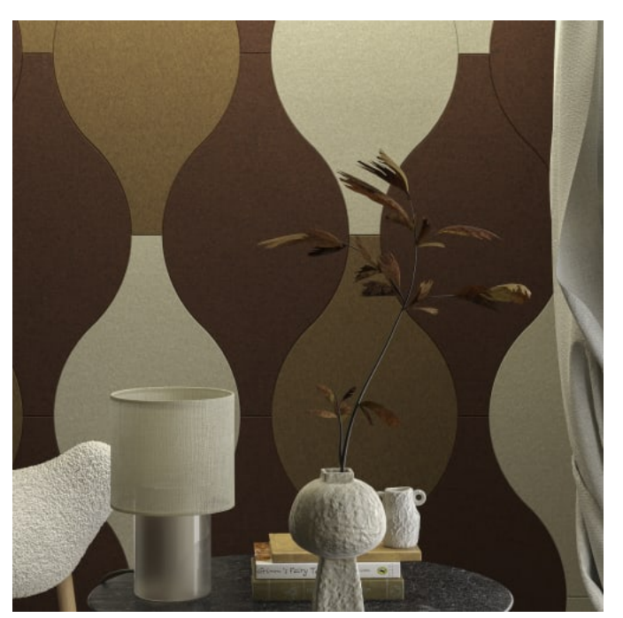
Plain Tile Hourglass Brick Ivory and Brick