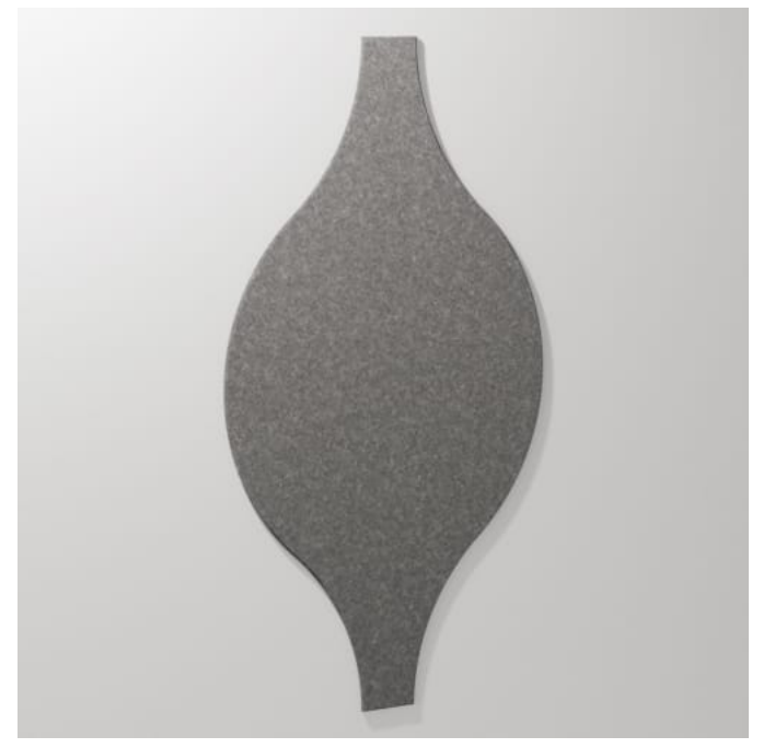
Plain Tile Hourglass Detail