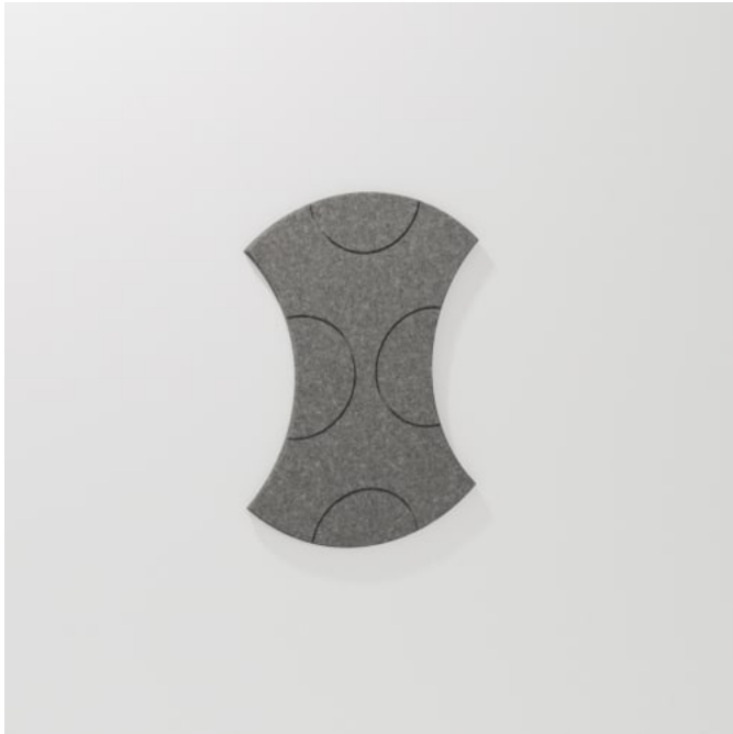
Etch Tiles Battleaxe Detail