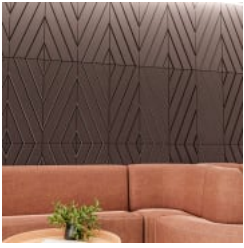
Etch Tiles Crossbar Detail