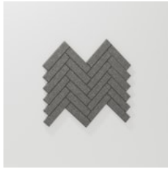
Etch Tiles Herringbone Detail