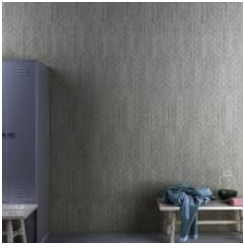
Etch Tiles Herringbone