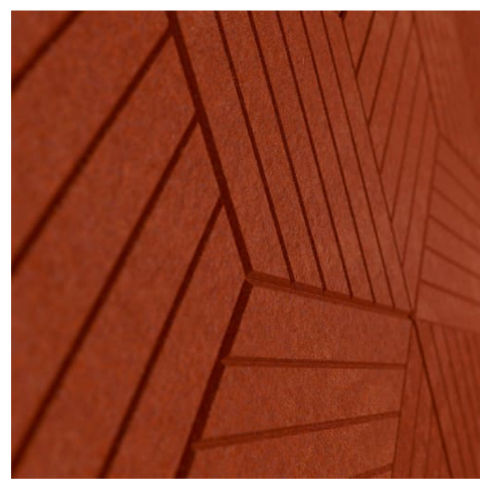
Etch Tiles Hex Detail