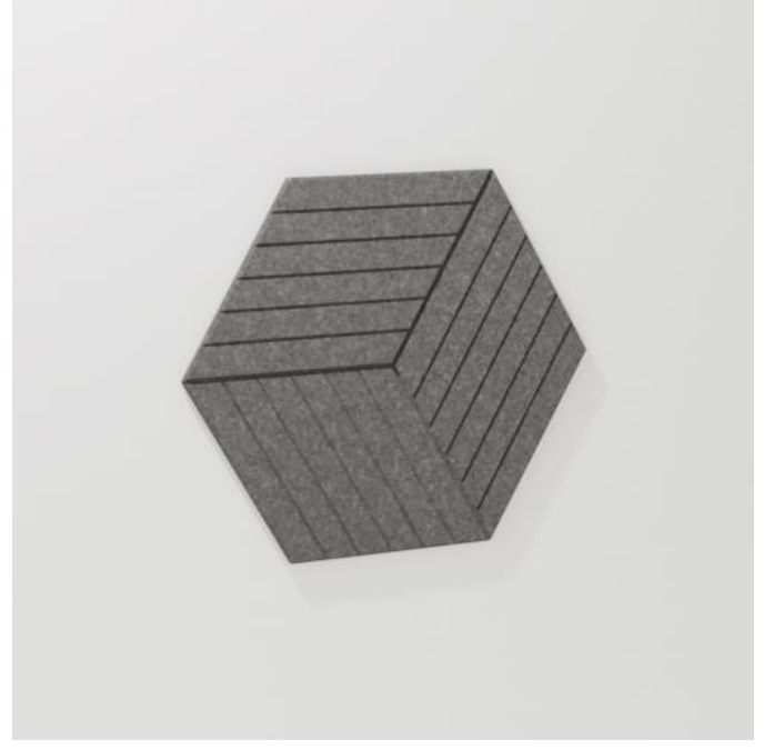
Etch Tiles Hexagon Detail