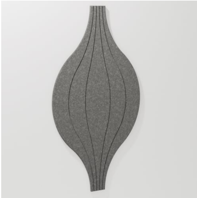
Etch Tiles Hourglass Detail