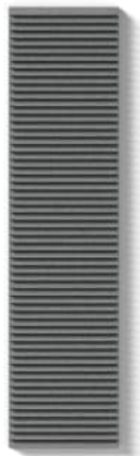
Etch Tiles Louver Detail