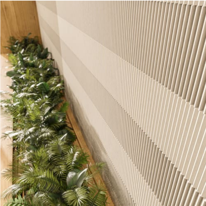
Etch Tiles Louver Detail