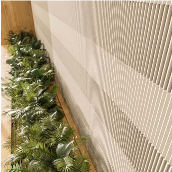
Etch Tiles Louver Detail