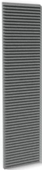
Etch Tiles Louver Detail 2