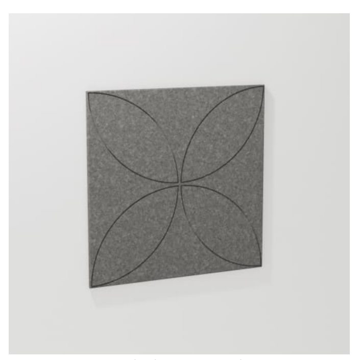
Etch Tiles Square Detail