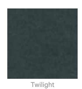
Zintra Timber Print