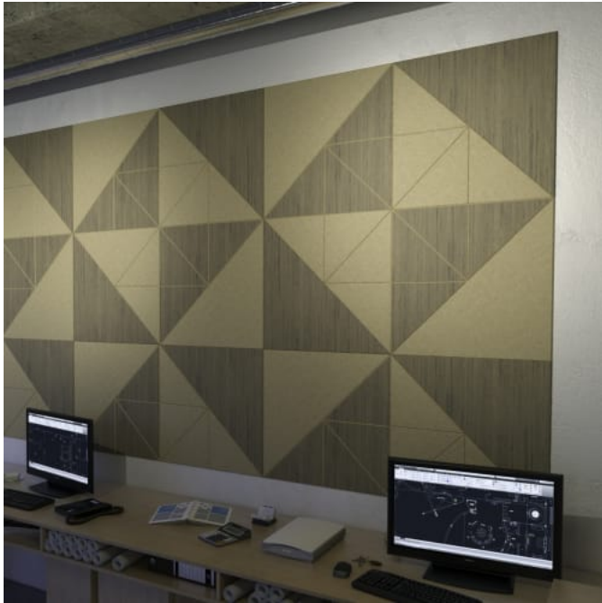
Etch Tiles Triangle Detail 2