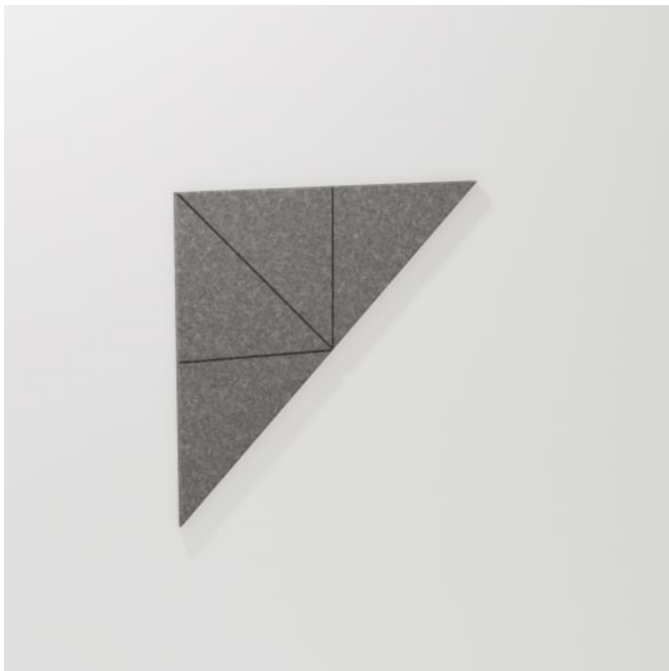
Etch Tiles Triangle Detail