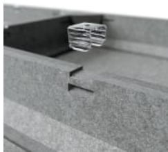
Box Tile Double Beams Clip Fixing Detail