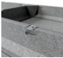
Box Tile Double Beams Clip Detail