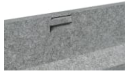
Box Tile Beams Clip Fixing