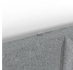
Box Tile Beams Clip Wall Mount