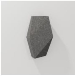
Box Tile Diamond Detail