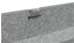
Box Tile Single Beams Clip Attached Detail