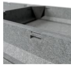
Box Tile Double Beams Clip Fixing