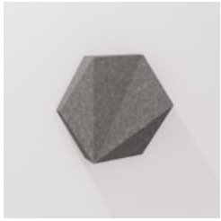
Box Tile Hex Detail