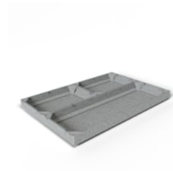
Box Tile Multi Tile Detail