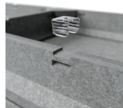
Box Tile Double Beams Clip Fixing Detail