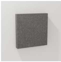
Box Tile Square 75mm 3in Detail