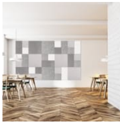
Box Tile Mixed Feature 2