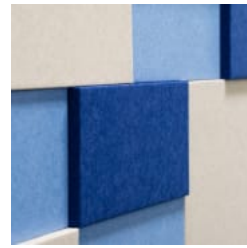
Box Tile Mixed Square Detail