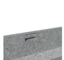
Box Tile Beams Clip Fixing