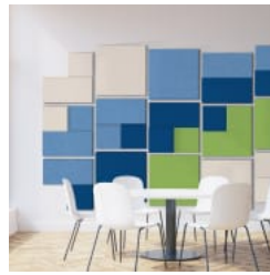
Box Tile Mixed Feature