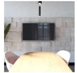
Box Tile Mixed 2