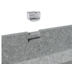
Box Tile Single Beams Clip Fitting Detail