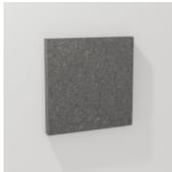
Box Tile Diamond 38mm 1.5in Detail