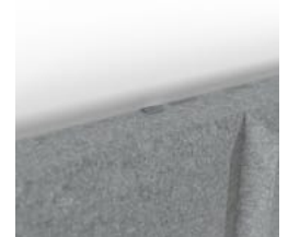
Box Tile Beams Clip Wall Mount