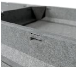
Box Tile Double Beams Clip Fixing