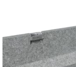
Box Tile Single Beams Clip Attached Detail