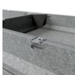
Box Tile Double Beams Clip Detail