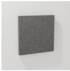
Box Tile Diamond 38mm 1.5in Detail