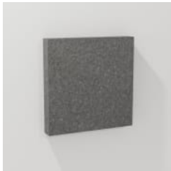
Box Tile Square 75mm 3in Detail