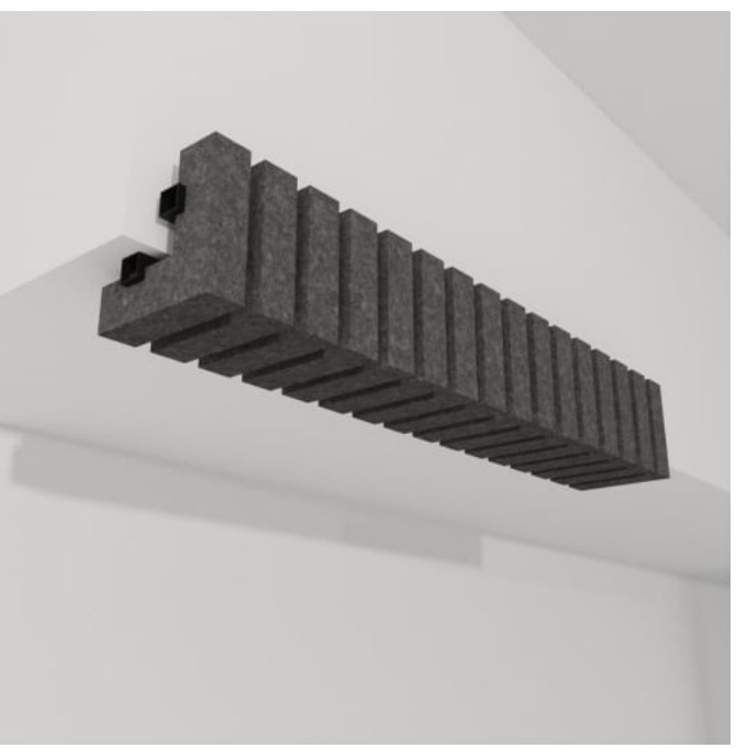
Sticks Bundles Landscape External Corner Narrow Detail