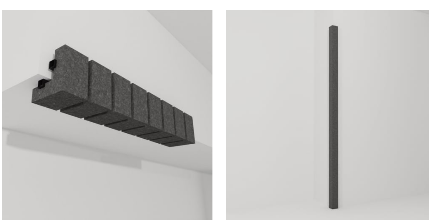
Sticks Bundles Landscape External Corner Wide Detail