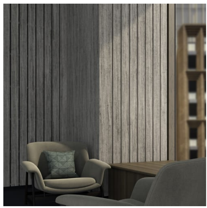
Sticks Bundles External Corner Portrait Wide Eucalyptus