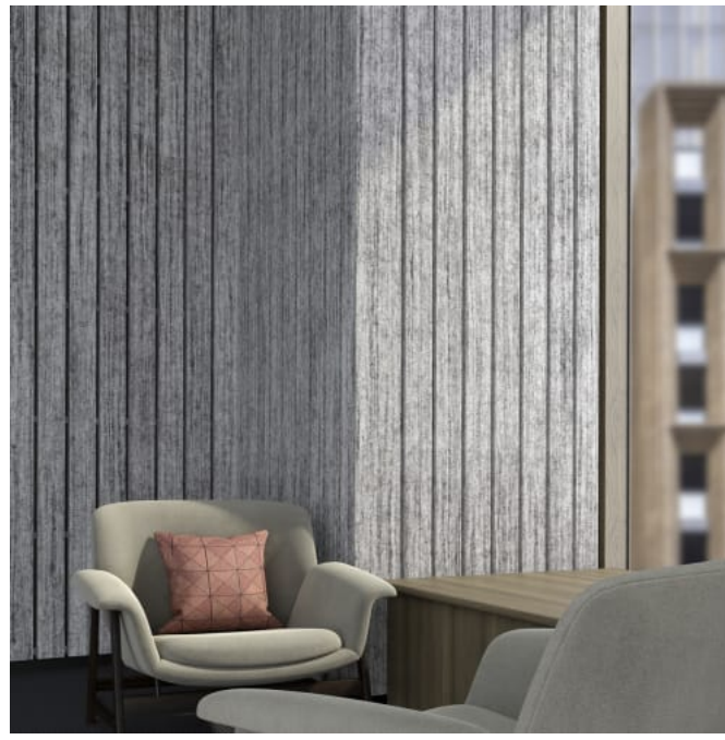
Sticks Bundles External Corner Portrait Wide Ironbark