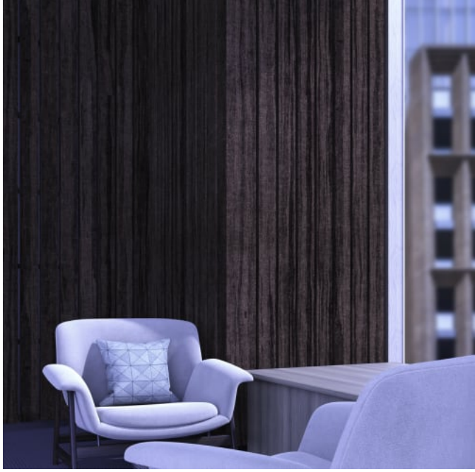
Sticks Bundles External Corner Portrait Wide Merbau