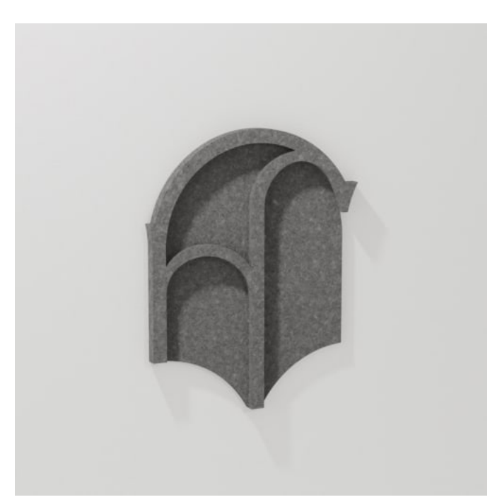
Pattern Tile Arch Detail