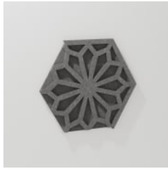
Pattern Tile Entwine Detail 2