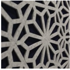
Pattern Tile Entwine Detail