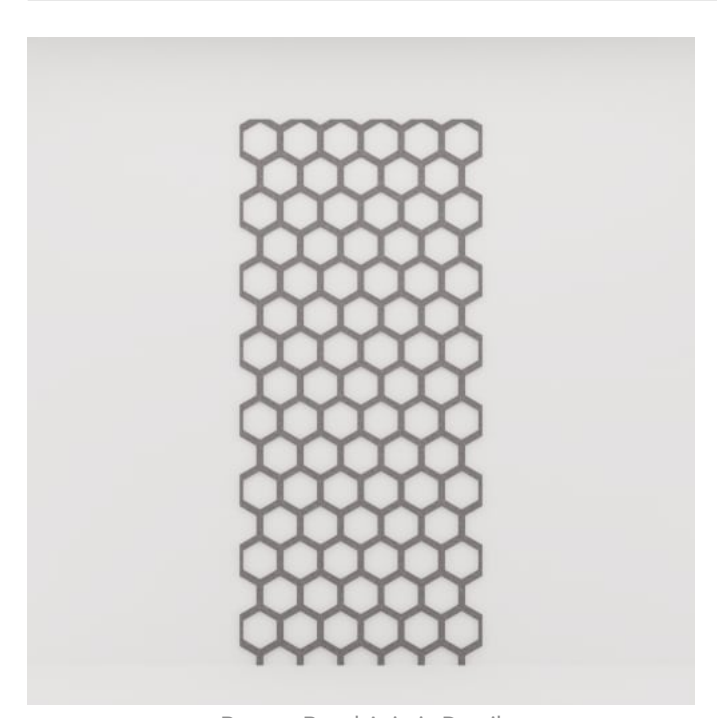
Pattern Panel Asiatic Detail