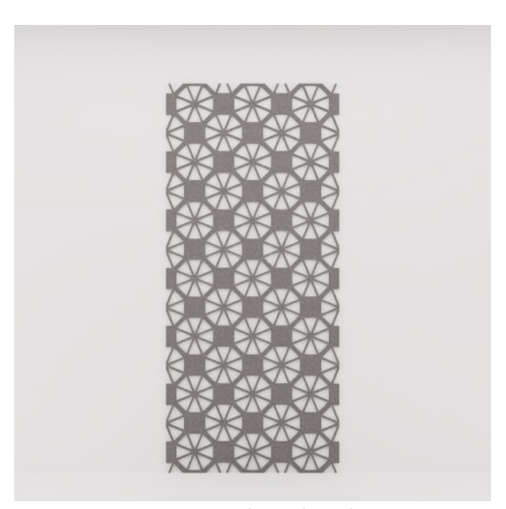
Pattern Panel Bengal Detail