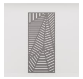
Pattern Panel Bushan Detail