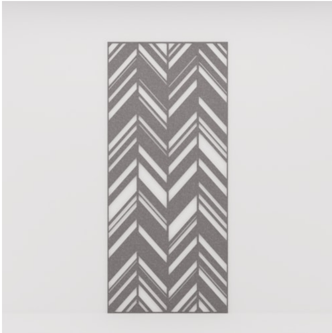
Pattern Panel Fishbone Detail