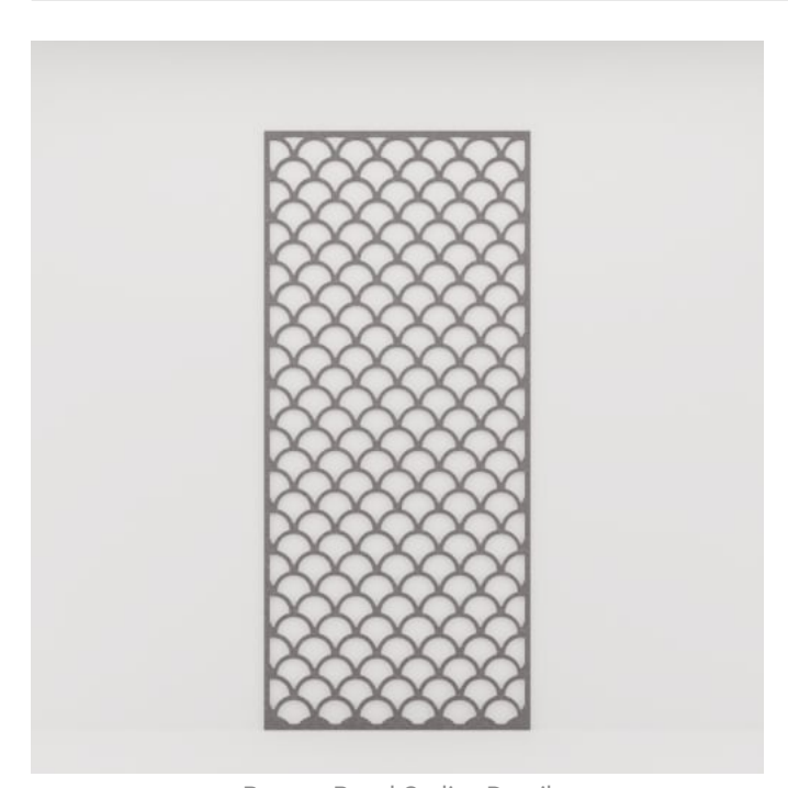
Pattern Panel Gadiva Detail