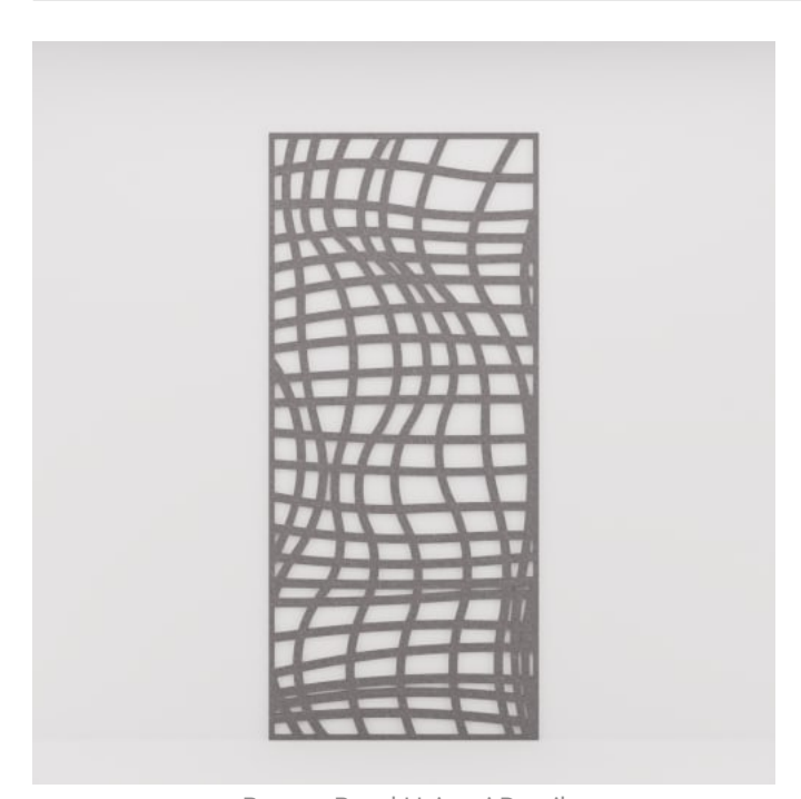
Pattern Panel Haimati Detail