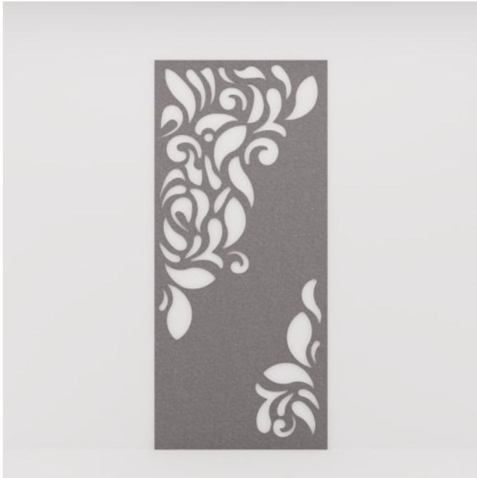
Pattern Panel Kerala Detail